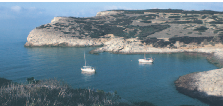
Cala dei Turchi, Isole Tremiti

Cala degli Inglesi lies on the W side of Isola San Domino. Steps lead from the cove up to a holiday camp, and ultimately to the village in the centre of the island. There is a shoal patch off the cove with two wrecks beyond it to the W. One of the wrecks is of a paddle steamer. The wrecks are not a hazard unless anchoring.